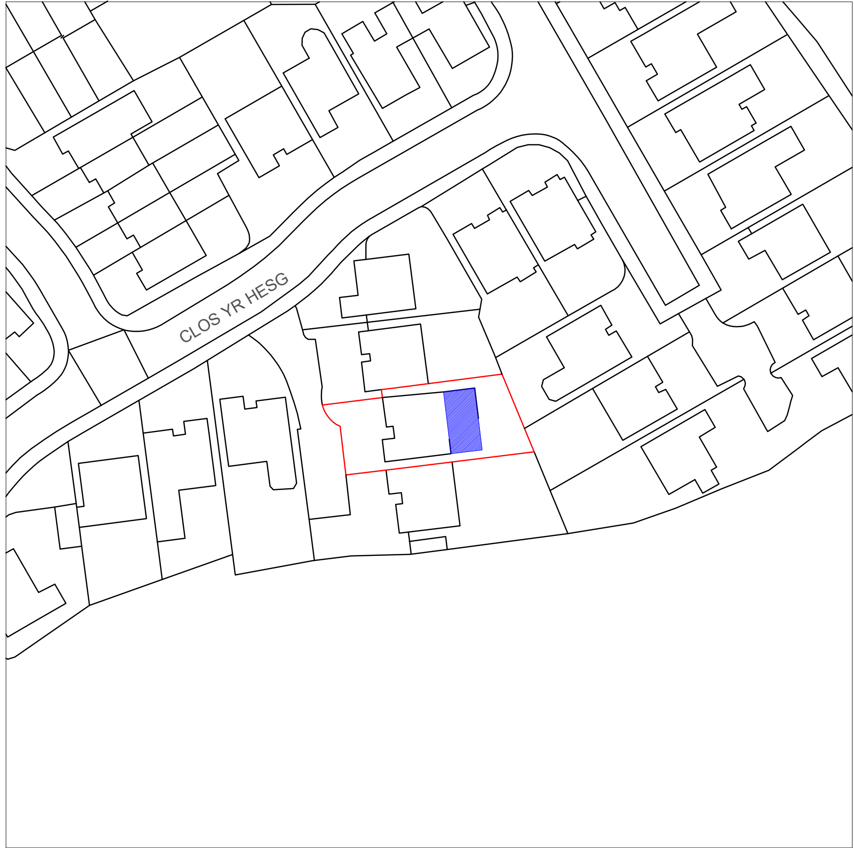
BLOCK PLAN | 1:500