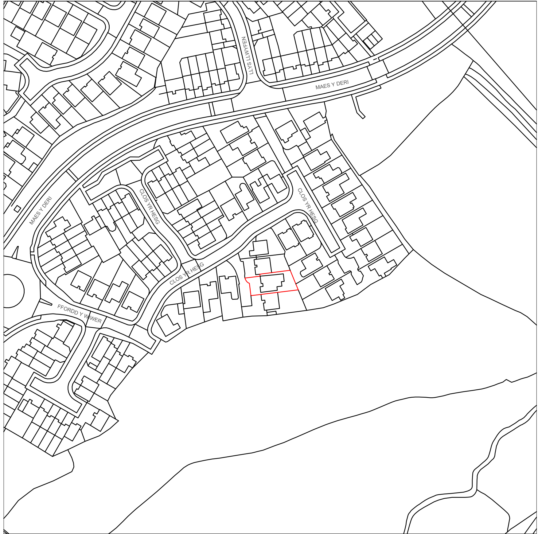
LOCATION PLAN | 1:1250