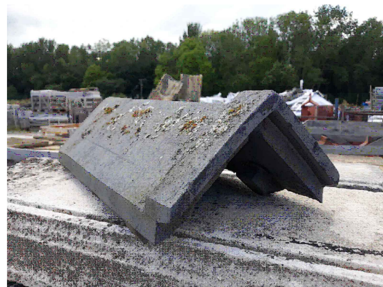
Vented Ridge Tile Bat Access Ridge