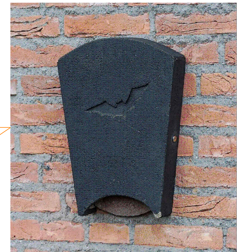
Woodstone/Woodcrete Bat Box located 2m+ above ground