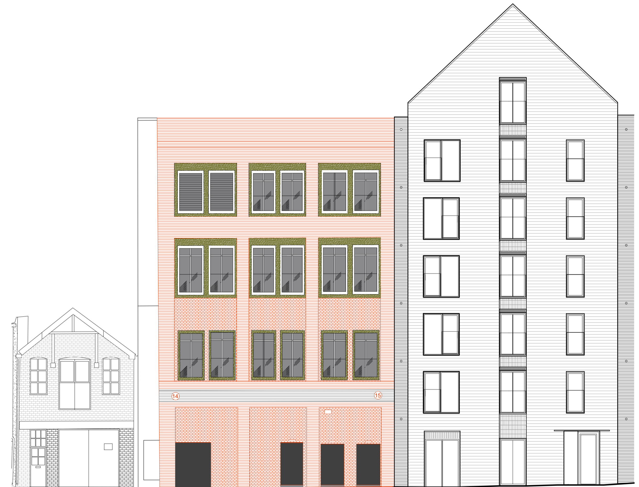
STRAND PROPOSED ELEVATION | 1:100