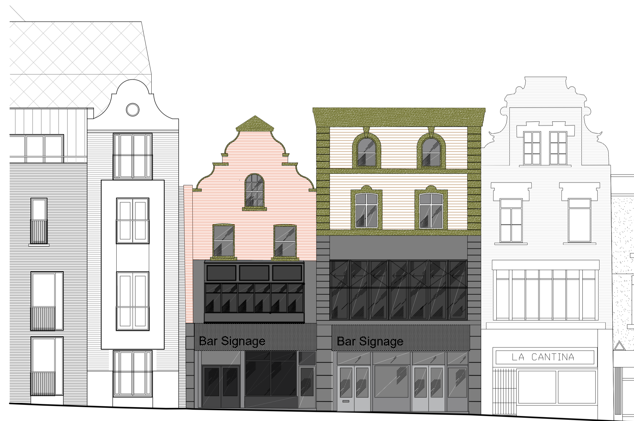
WIND STREET PROPOSED ELEVATION | 1:100