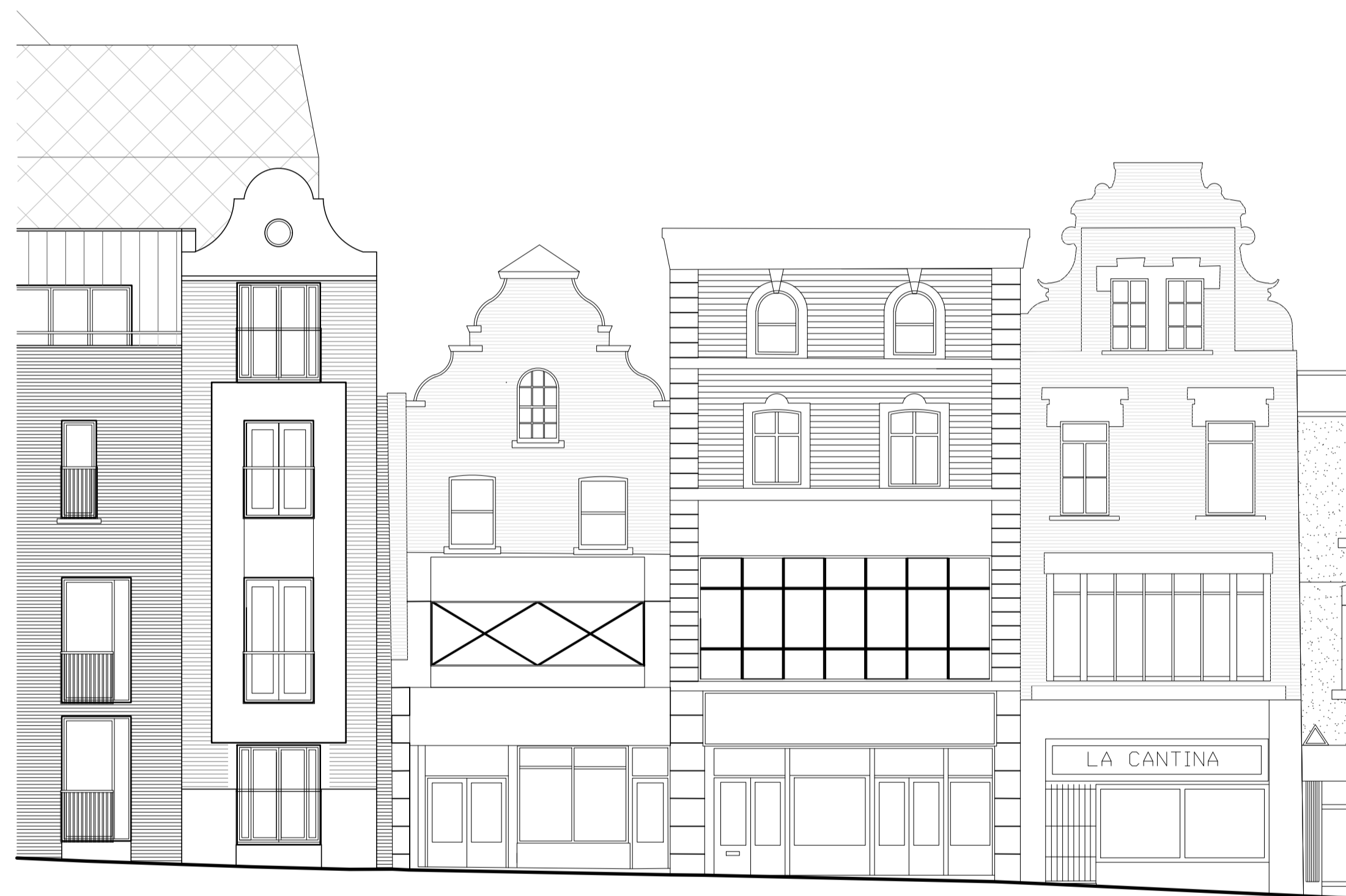
WIND STREET EXISTING ELEVATION | 1:100