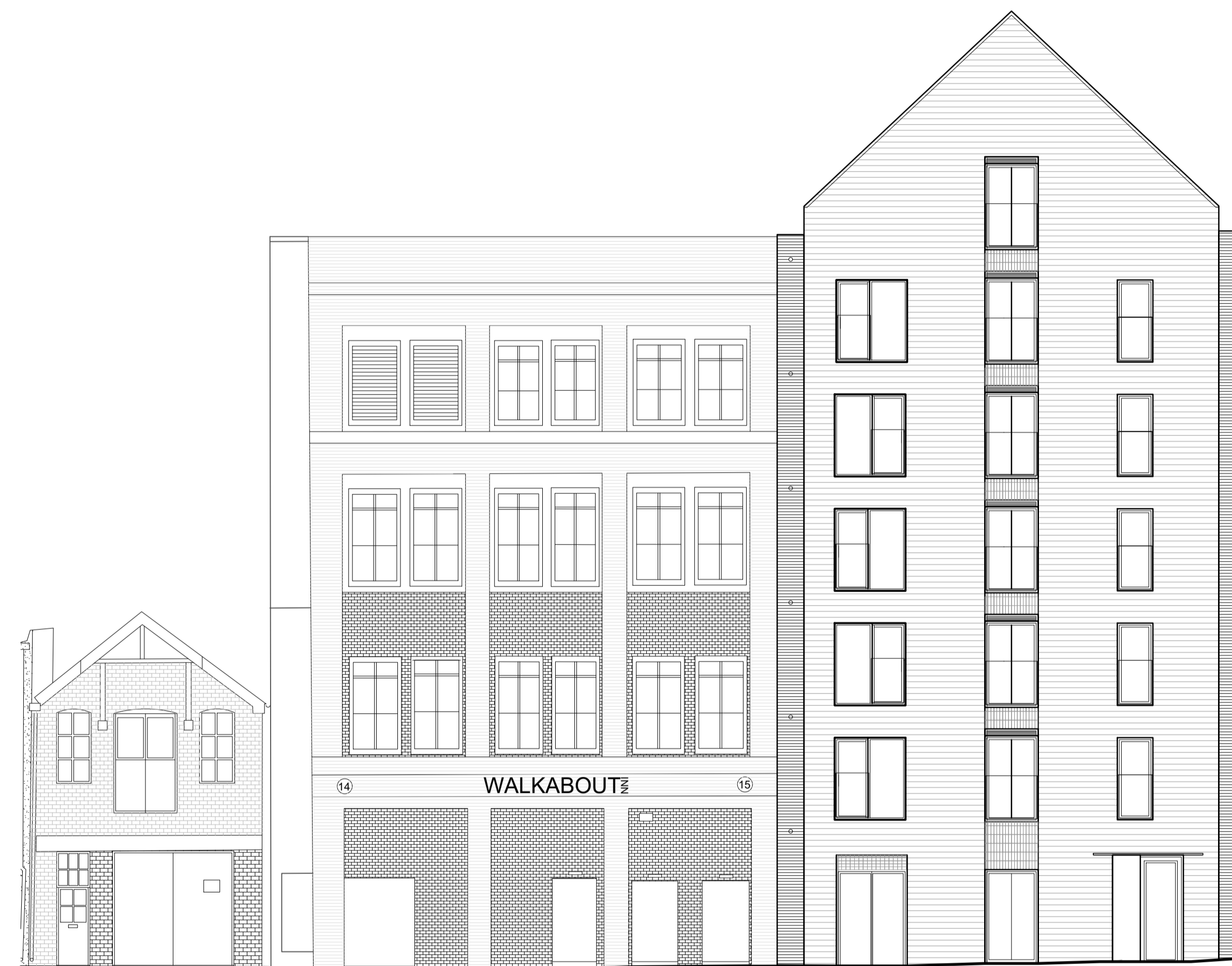
STRAND EXISTING ELEVATION | 1:100